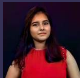
VIGASINI. S II RANK